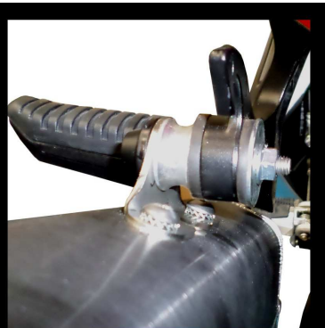
Silenziatore sinistro Left silencer